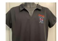
ladies polo top