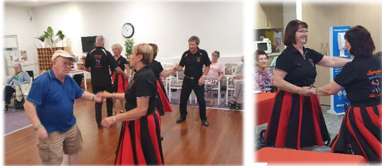
Entertaining the Oldies

We also performed at seven Residential Care facilities so far and all were very successful. We have been asked back by the residents as well as the co-ordinators. Our last demo was at Rose Court, Gilles Plains and whilst performing the Rock and Roll Waltz a couple of residents joined us on the dance floor and did a beautiful waltz together. They were very emotional as they hadn't danced for such a long time. This is one of the reasons we love performing for the Residents as it brings back beautiful memories and enjoyment from years gone past.